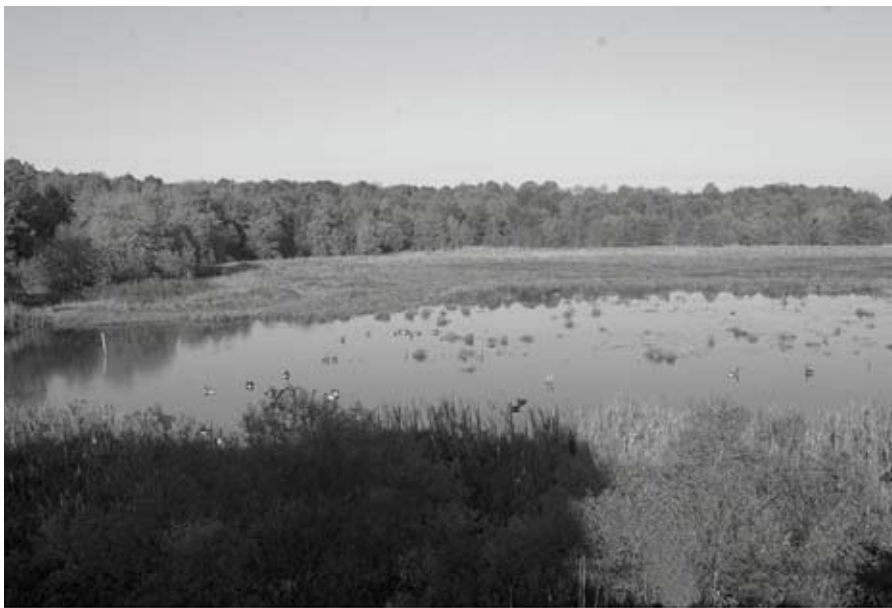
View from the Tower - October 2005

There will be additional opportunities for